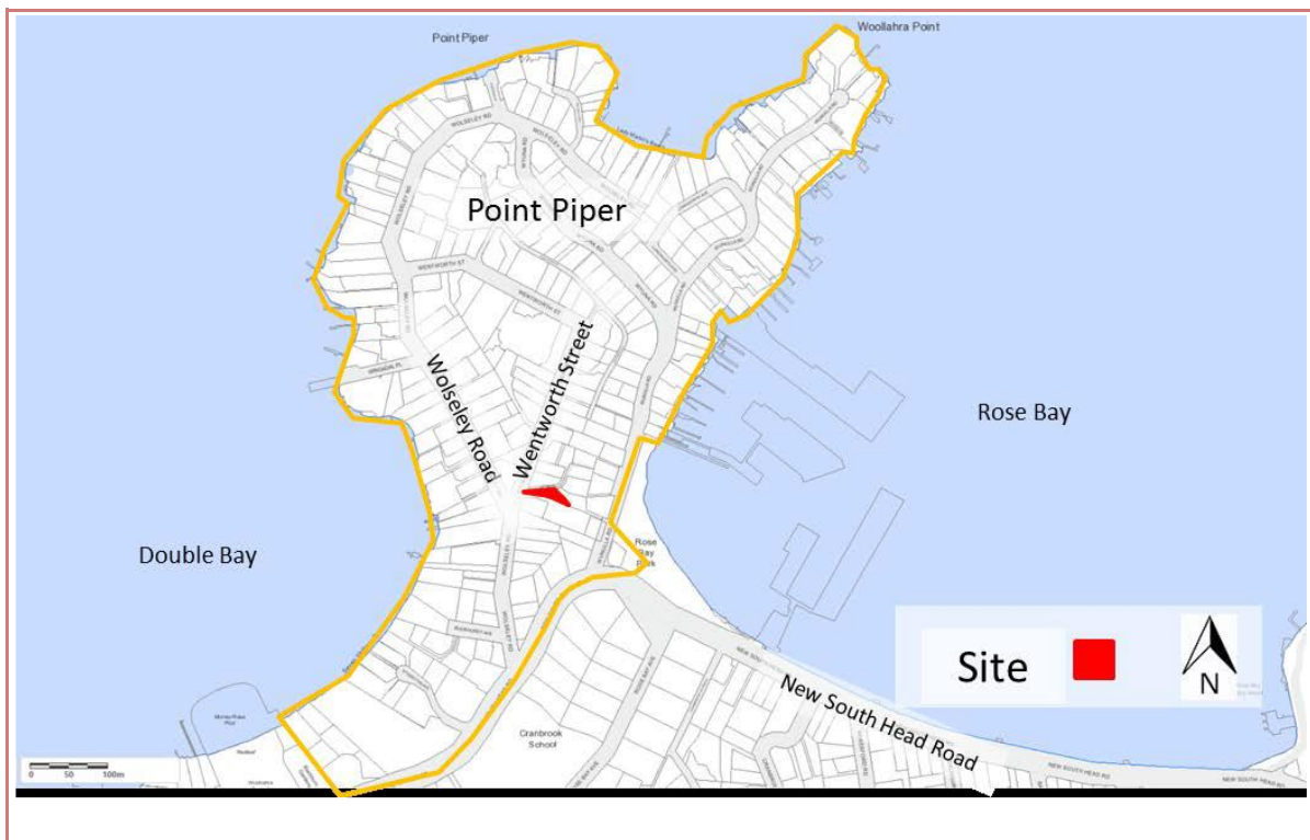
Figure 1 Context map for site .

The site was created as a result of a subdivision of the Dunara Estate in 1956. Lot 11 in DP 27451 was designated as Public Garden and Recreation Space. The site is owned by Woollahra Council. The site contains a range of exotic and native trees including a mature Cook’s Pine which is local heritage item No. 277 in Woollahra LEP 2014. The subdivision contains two other local heritage items – the house and interiors at 10 Dunara Gardens known as “Dunara” (item No. 276) and the house, interiors and grounds at 4 Dunara Gardens (item No. 275). A Cook’s Pine and Moreton Bay Fig, located on the adjoining site at 1 Wentworth Street, are listed as a local heritage item (No. 285). No. 10 Dunara Gardens is also listed on the State Heritage Register.