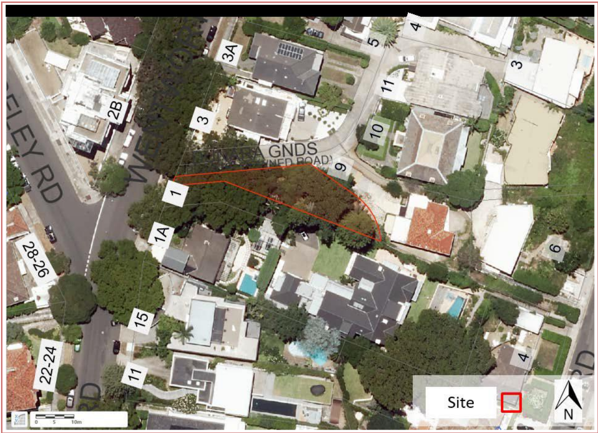
Figure 3 Aerial photograph showing the subject site outlined in red