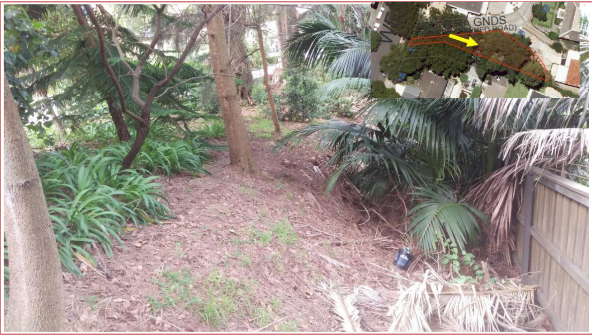
Figure 4 Within the site – looking east